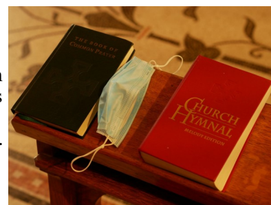
A sign of the times... a prayer book, a church hymnal and a mask on the prayer desk