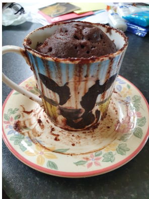
The Mug Cake from one of the online school assemblies!

Cathedral Choir School, Rathgar National School and Powerscourt National School in Enniskerry. The Department of Education and Skills increased the number of Principal Release Days to one day per week for this academic year, for teaching principals, to enable them to carry out the additional administration with regard to COVID-19.