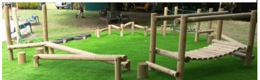
A sample of the type of Trim Trail equipment available.

Trim Trail: As soon as the new ramps, steps and pathways are completed, new fencing with gateways will be installed at both sides of the school; the one between the school and the boundary wall adjacent to the parish centre will have a vehicular access gateway and the fence on the opposite side will have a pedestrian gateway. The fencing and gateways are required by our insurance company prior to the installation of the new playground equipment called a Trim Trail, which we are very excited about! The Trim Trail is designed to help develop children's mobility and sensory skills as well as their imagination and sense of exploration and discovery, and it is FUN! Thank you to the Parent-Teacher Association for their fundraising efforts for this project and thank you to the generosity of all who have made this possible.