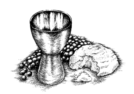
Bring your own mug for a cuppa afterwards!

Sunday 9th January 2022 8.30 Holy Communion - St Thomas' Church