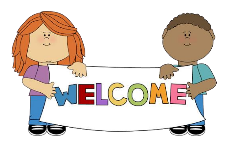
[Please stand, if you are able]